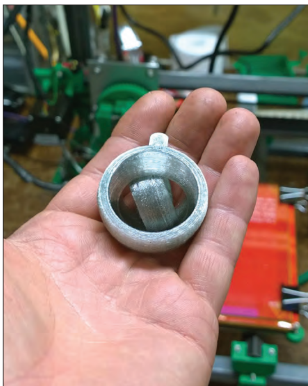
FIGURE 3 Keychain printed with recycled polyethylene terephthalate (PET) filament made with the Thunderhead filament extruder and printed using a Retr3D printer.

as an excellent product for demonstrating the potential impact of open source design combined with distributed manufacturing via 3D printing (figure 4).