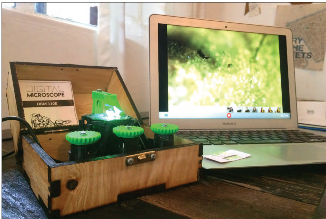
FIGURE 4 Open flexure microscope (left) made in Nairobi using Retr3D printers. Microscope view is projected on the laptop screen.

TechforTrade also spoke with five schools in Tanzania and six in Kenya about the feasibility of introducing the microscopes in the classroom. STICLab and AB3D have sold a few microscopes to parents and are starting to test them in schools. Early feedback indicated a need to bundle the microscope with educational materials to make learning easier. Digital Blacksmiths Nairobi has started to bundle the educational microscope with slides and activities.