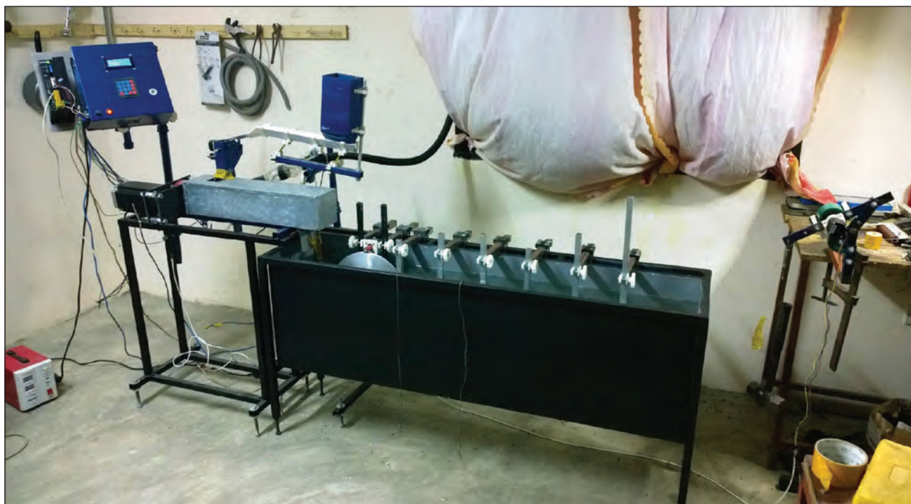
FIGURE 2 Thunderhead filament extruder prototype at STICLab in Dar es Salaam, Tanzania.